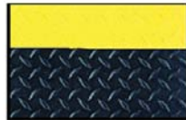
Black with Yellow Safety Border