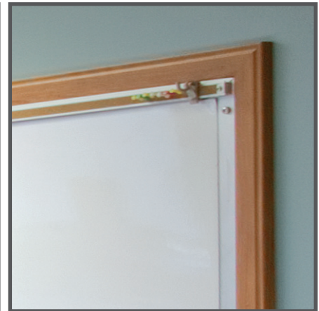
Accent Trim Pieces