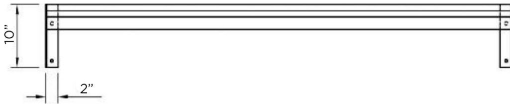
MODEL US-BUW Front Elevation

When specifying this product please include: