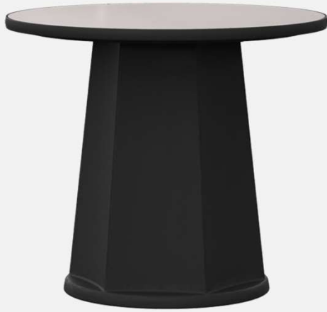
5006-36R-HPL 36" diameter x 30" Game HPL Available

ModuForm's unique and contemporary ModuMaxx cafe table invites patients and caregivers to connect and converse, helping to reduce stress, lift spirits, and boost cognitive function, all while fostering a warm sense of community and emotional support.