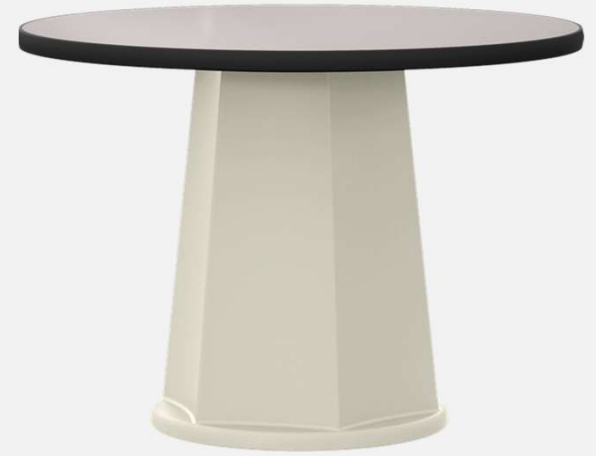
5006-42R-HPL 42" diameter x 30" Game HPL Available

When promoting positive social interactions is key, the ModuMaxx collection of chairs and tables creates environments that soothe, inspire, and rejuvenate.