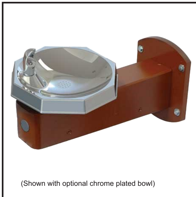
(Shown with optional chrome plated bowl)

All solid brass castings shall conform to ASTM standards B61 and B62. Unit is certified to ANSI A117.1, Public Law 111-380 (NO-LEAD), CHSC 116875 and NSF/ANSI 61, Section 9.