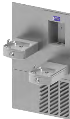
Rounded Box Chilled Barrier-Free Wall Mount Bi-Level Drinking Fountain with Sensor Activated Bottle Filler A152408F-BF4-W32-BCD