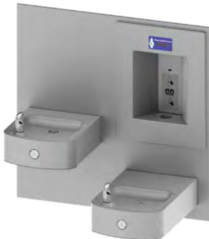
Rounded Box 14-Gauge Stainless Steel Box Barrier-Free Wall Mount Bi-Level Drinking Fountain A152400S-FG-BF4 -BCD

Cape Cod Systems Corporation Tel. 1-888-227-8555 www.capecodsystems.com