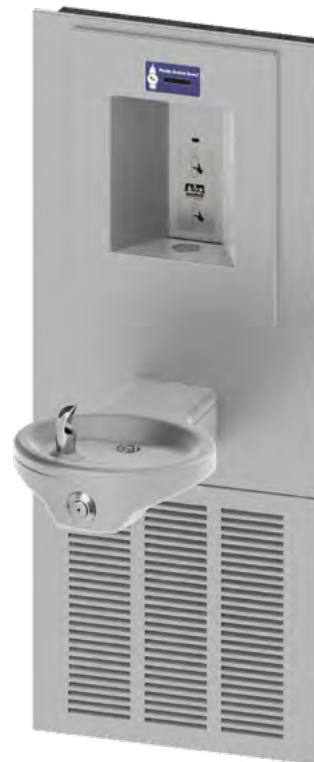
Oval Bowl Chilled Barrier-Free Wall Mount Drinking Fountain with Sensor Activated Bottle Filler A131408S-BF4-BCD