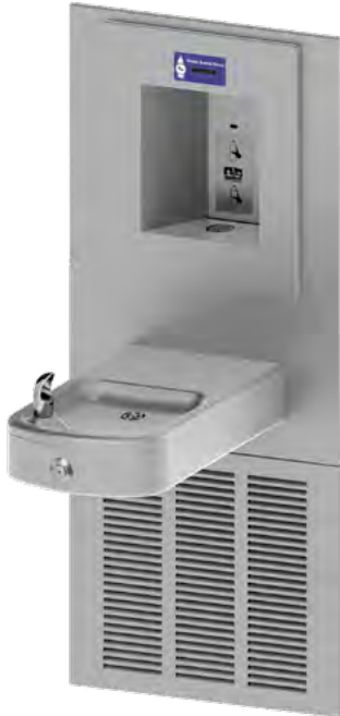
Rounded Box Chilled Barrier-Free Wall Mount Drinking Fountain with Sensor Activated Bottle Filler A151408S-BF4-BCD