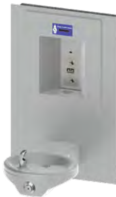
Oval Bowl Barrier-Free Wall Mount Drinking Fountain with Sensor Activated Bottle Filler A131400S-BF4-BCD