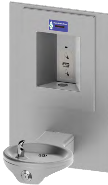
Oval Bowl Barrier-Free Wall Mount Drinking Fountain with Sensor Activated Bottle Filler A131400S-BF4-BCD