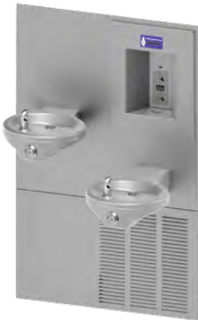
Oval Bowl Chilled Barrier-Free Wall Mount Bi-Level Drinking Fountain with Sensor Activated Bottle Filler A132408S-BF4-W32-BCD