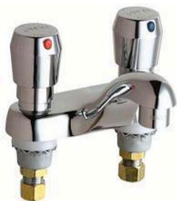
802-V665CP – 4" Center Lavatory Faucet

The faucet is 8" wide, 3" high and approximately 8" long depending on the distance to the wall or backsplash. It weighs approximately 8 lbs and is attached to the sink by two threaded nuts around the water inlet pipes. The faucet can be cast in white, almond or several stone looking textures. The water duration can be set from 8-20 seconds.